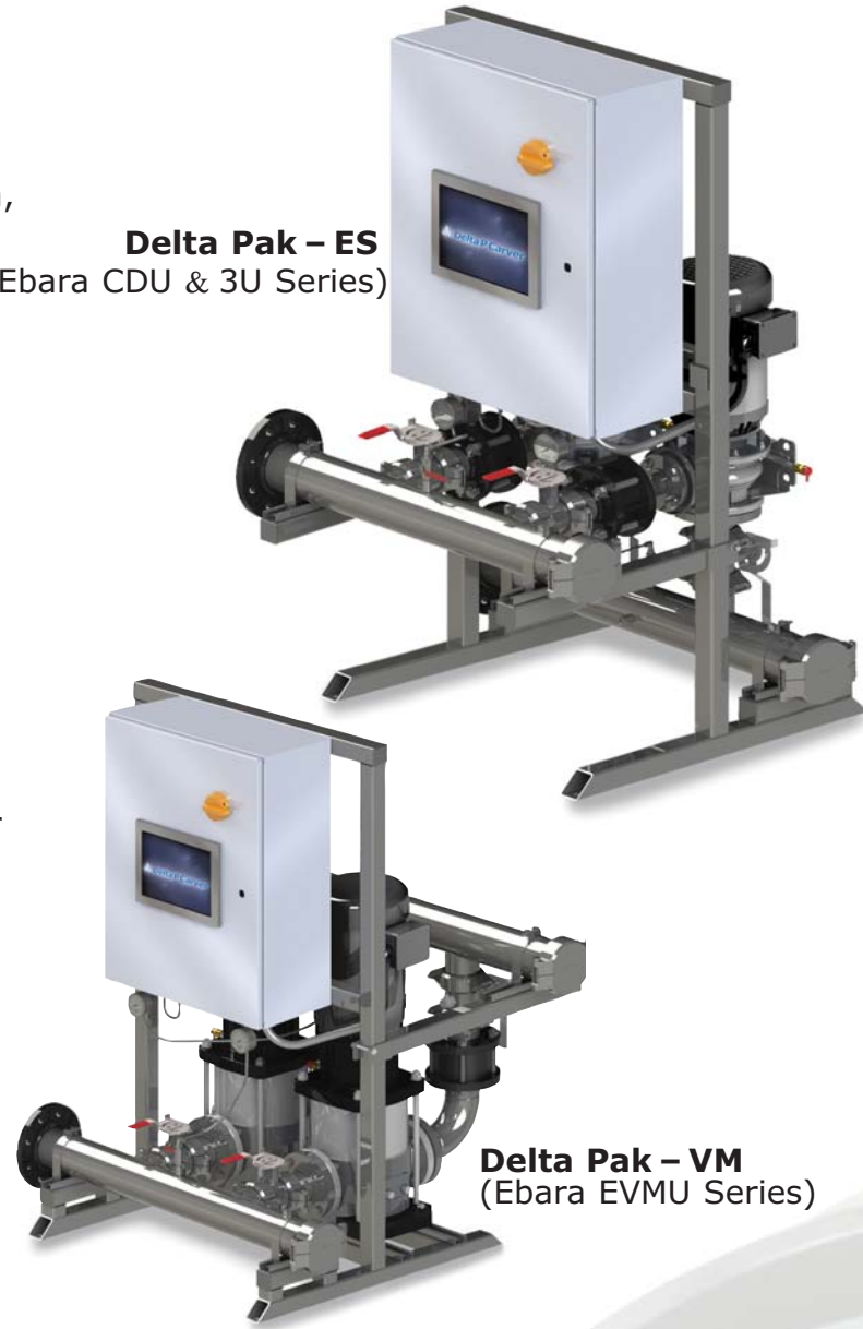
Delta Pak – VM (Ebara EVMU Series)