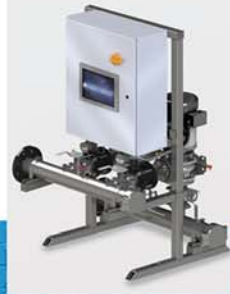
Delta Pak - VM